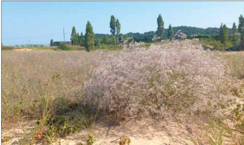
Full-sized baby’s breath growing on Elberta Beach.

A single baby’s breath plant can produce 14,000 seeds each year. Additionally, baby’s breath is often included in wildflower seed mixes, inadvertently introducing the plant to yards and surrounding natural areas. The negative impacts of baby’s breath can be seen in our community, as it spreads quickly and overtakes dunescapes, threatening habitat for native species, such as the federally threatened pitcher’s thistle and endangered piping