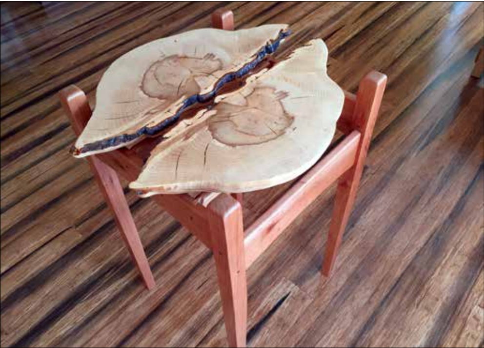
Top: One of three Schwinn Stingray bikes that Kurt Swanson entered in the 2015 ArtPrize in Grand Rapids. Bottom: A custom table.